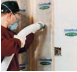
OPTIMA® closed cavity insulation system