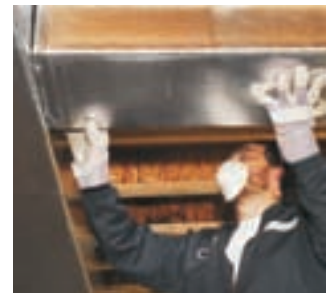
ToughGuard® HVAC duct board