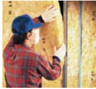
Unfaced fiber glass insulation