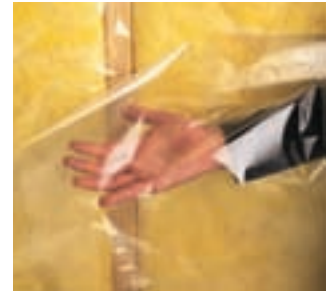
MemBrain™ The Smart Vapor Retarder