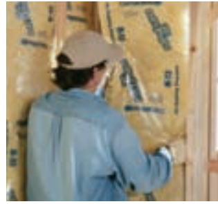
DryRight™ fiber glass insulation