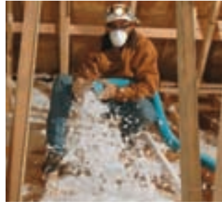
InsulSafe® SP fiber glass blowing insulation