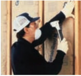
Kraft faced fiber glass insulation