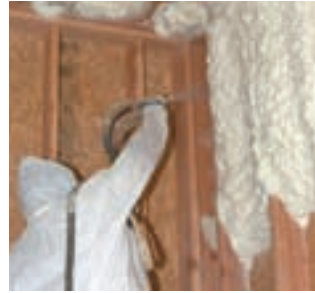
Certaspray™ open cell foam insulation